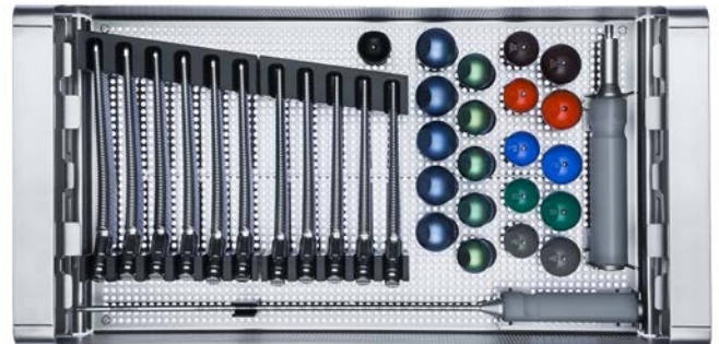
Rasp Instrument Set Müller Straight Stem