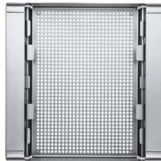
Mini Monolite Tray 60