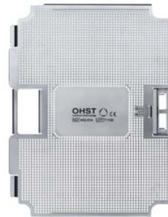
Lid for Mini Monolite Tray 60